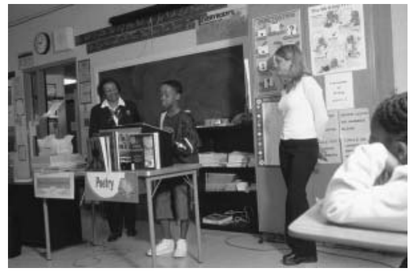
Direct observation is an important way to assess students' progress.

Qualitative and Quantitative Data. Our questions determine the types of data collection techniques we use, and the data collection techniques determine the types of data that result from our procedures. There are two general categories of data, qualitative data and quantitative data.