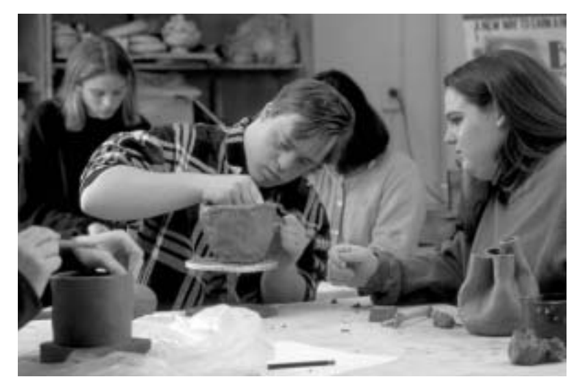
Each child has his or her own unique set of abilities and needs.

answer this question is a complex problem. Many factors affect how and what a person will learn in any given situation. In an effort to make sense of this situation, Jenkins (1979) proposed a model of learning research called the theorist's tetrahedron or simply the tetrahedral model . The tetrahedral model is a model of four key instructional variables and how they affect each other. Figure 1.2 provides a drawing of the tetrahedral model modified for use with both research and classroom learning.