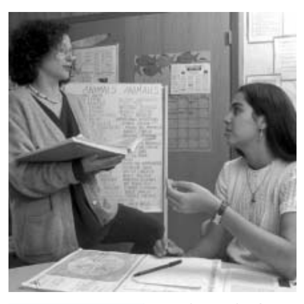
Use other teachers' experiences to improve your teaching and to stay up-to-date in the profession.