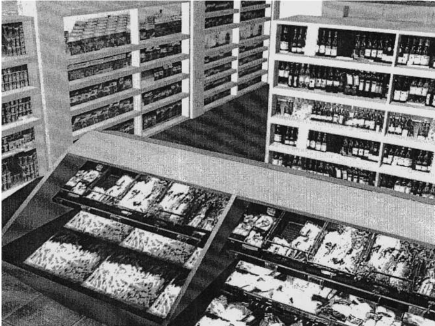
Figure 7.2 Virtual supermarkets.

for example. Learning tasks are attempted in it. As the user becomes more familiar with the tasks, more complex worlds can be substituted. In fact, there are many ways in which the designer can manipulate the virtual world to provide graded assistance to learners.