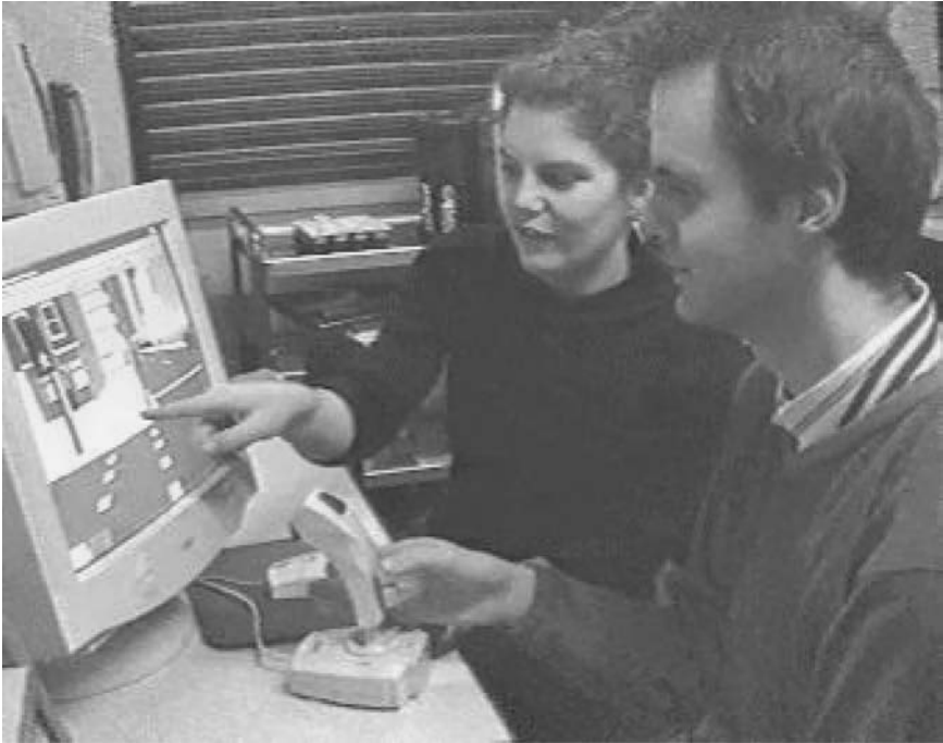
Figure 7.1 Using virtual environments.

environments in addition to those shared with other forms of computer-delivered education, which make them particularly appropriate for people with learning difficulties. First, virtual environments create the opportunity for people with learning difficulties to learn by making mistakes but without suffering the real, humiliating or dangerous consequences of their errors. People with learning difficulties are often denied real-world experiences that might promote their further development because their carers are apprehensive of the consequences of allowing them to do things on their own. Accompanied visits to a real environment sufficient to learn a skill may be impossible to arrange. However, in the virtual environment they can go where they like – even if their mobility is restricted.