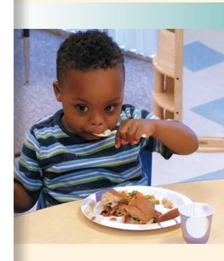
Effective, inclusive programs begin with a high-quality, developmentally appropriate foundation.