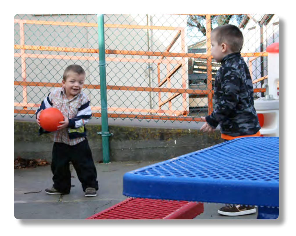
Identifying Concerns and Finding Help

When the concerns are about behavior issues or the safety of the child, it may be helpful to provide general information about ways that parents can talk about it with their children. A sample letter that can be shared is included in Appendix C: Sample Forms .