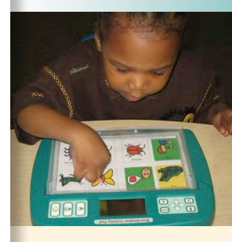
Using adaptive devices to facilitate participation.