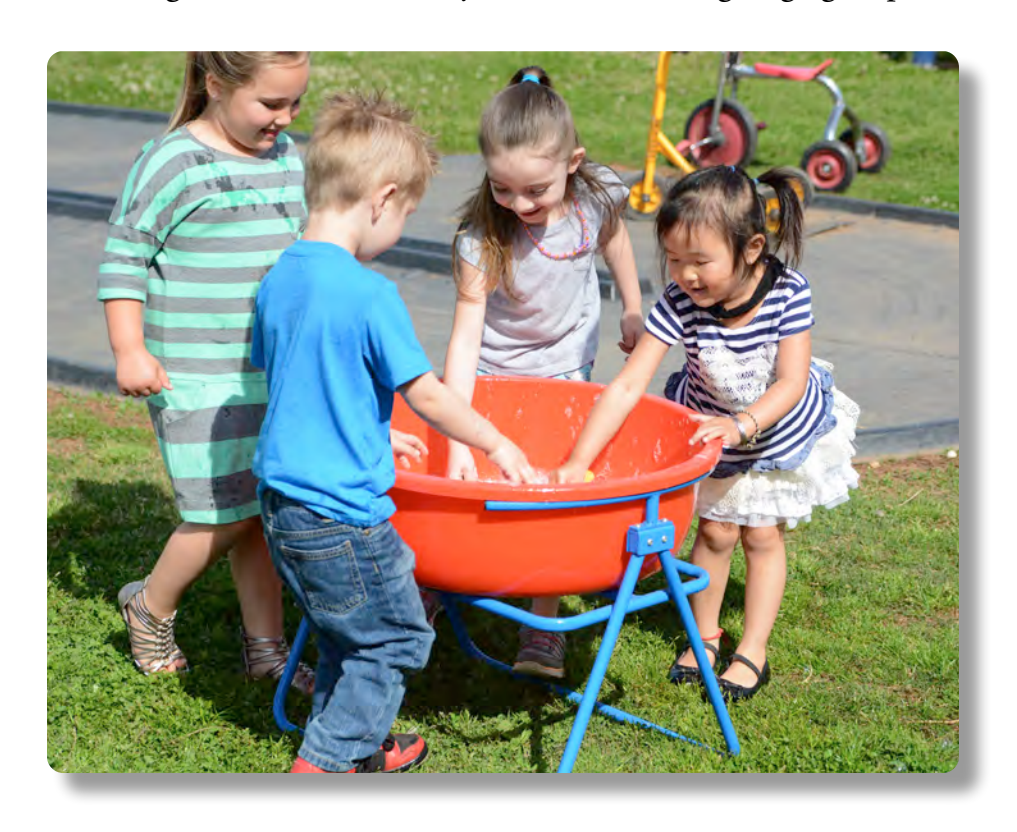
Creating Inclusive Child Care Settings

Some children require small changes to the curriculum or minor supports to get the most out of certain activities. These sorts of things can consist of fairly simple accommodations, such as providing a chair to assist the child in participating in circle-time activities to maintain the child's engagement, a special place or quiet activity for a child who is learning to manage emotions in a busy classroom during large group