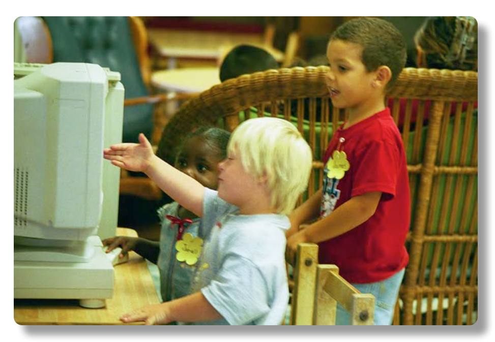
field trips in the neighborhood. However, he did not like their indoor games and started getting into trouble.