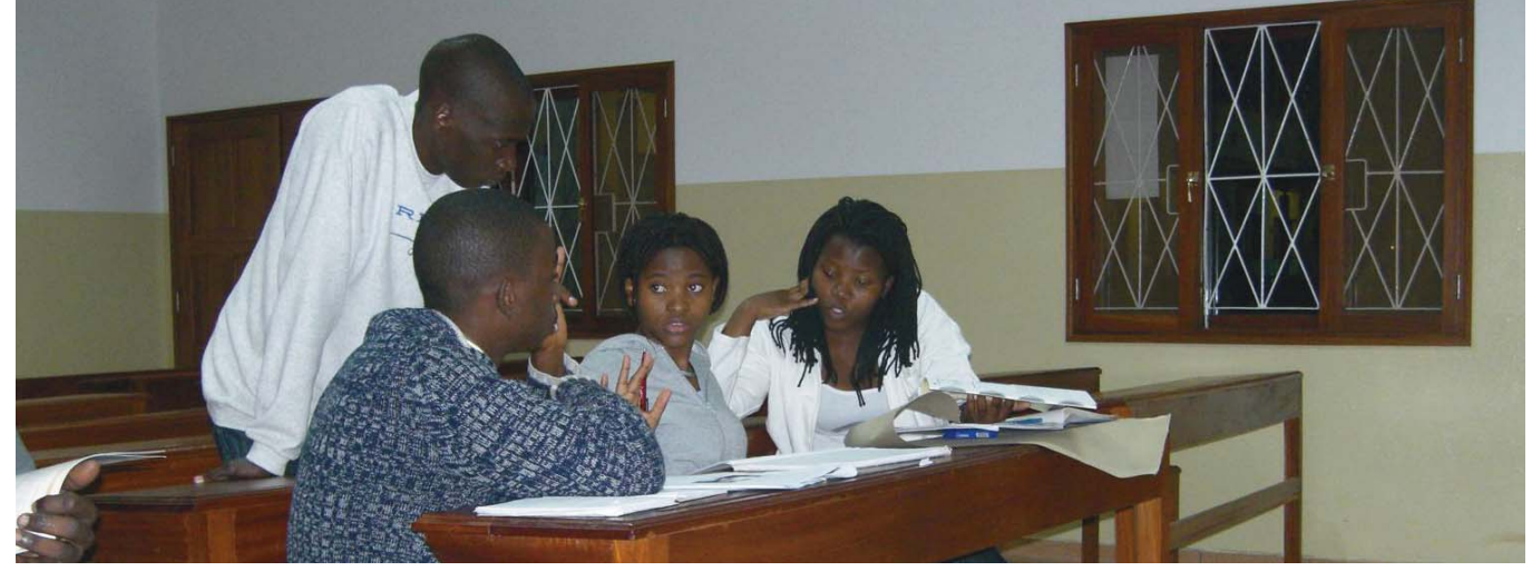
Students on the inclusive education course