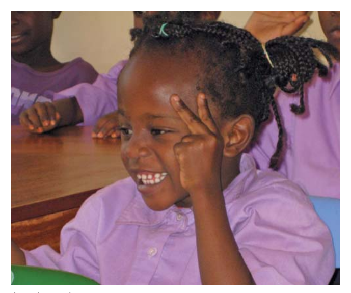
Learning to sign

Fifteen parents started learning weaving, rug-, quiltand shoe-making, tailoring and beadwork – often using recycled materials. Parents are now earning something through a small shop we set up.