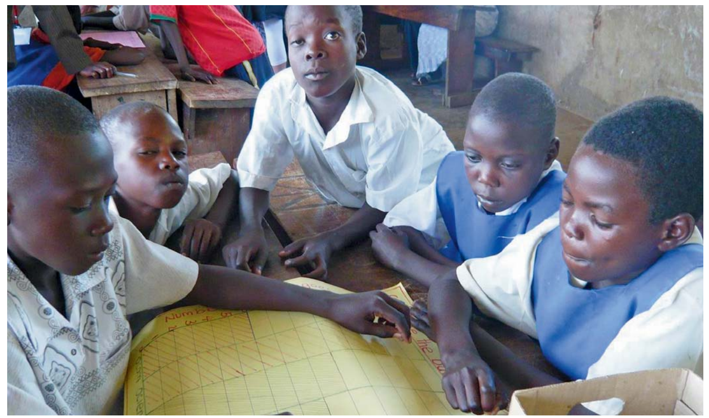
Children working together

Based on my experience, I have the following advice for teachers: