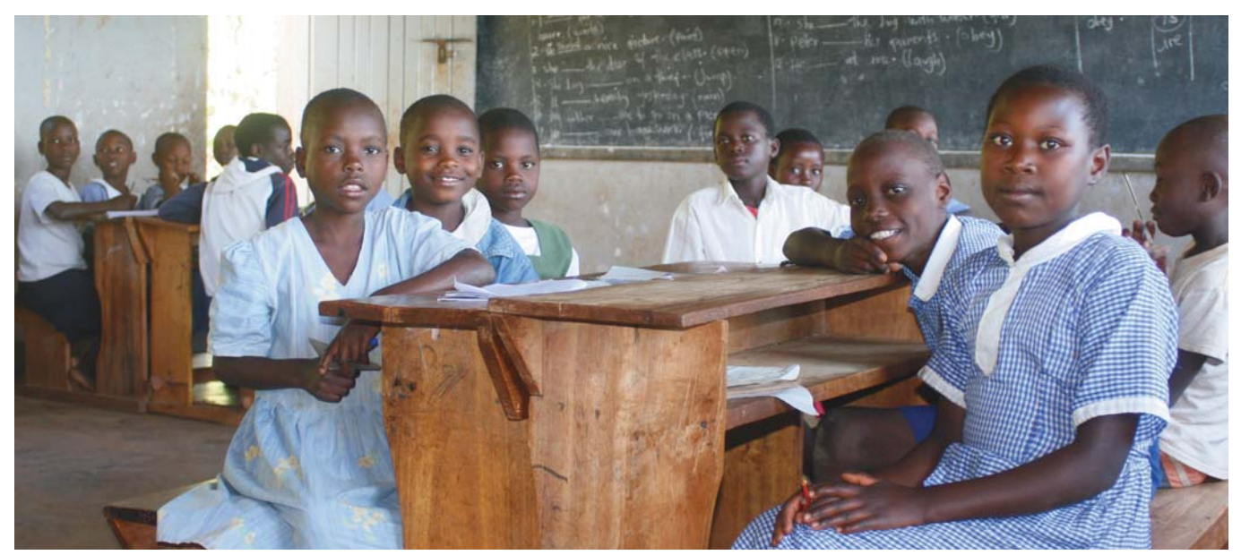
Deaf children in class in Bushenyi

<sup>1</sup> Deaf Child Worldwide internal report 2009.