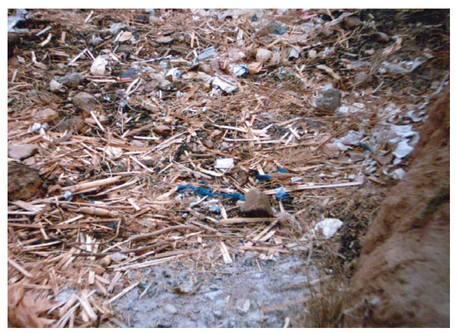
School rubbish pit (photo taken by children in Zambia)

Bad smells from latrines and rubbish pits distract children in class, affecting their concentration and learning.