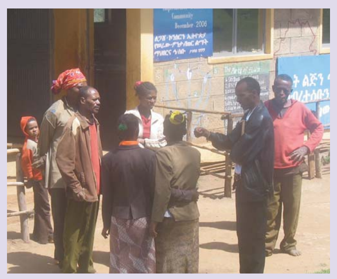
A discussion with ABE facilitators