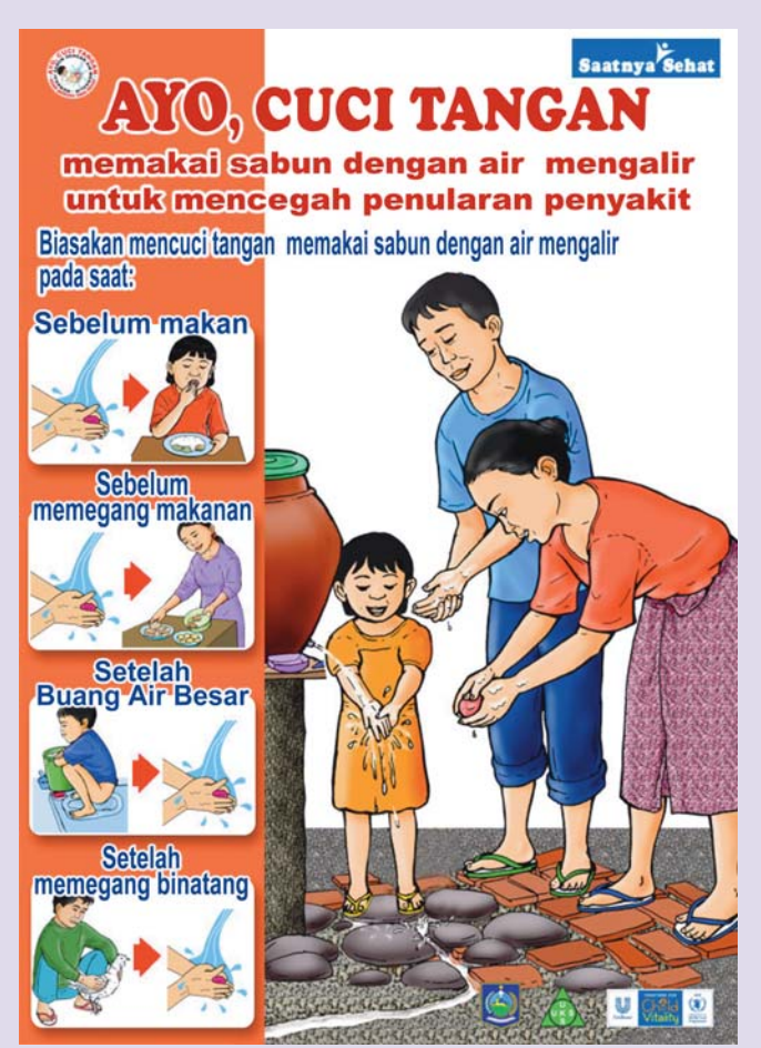
Example of a poster showing the importance of handwashing

Through a participatory workshop, WFP, Unilever and government officials analysed existing school health programmes and the results of a 'knowledge, attitudes and practices' survey. A campaign strategy was developed and joint responsibilities for implementation and monitoring were defined.