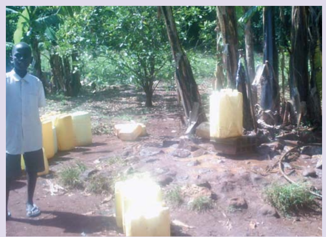
Water collection point, Agururu Primary School, Uganda