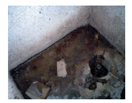
between teachers' and pupils' toilets

toilets are reserved for use by a few must use a few very poor toilets.