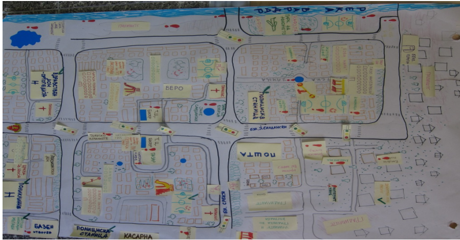
An example of a map created in Macedonia

[Image description: The map shows the layout of streets in a grid pattern. There are lots of small squares illustrating where houses, shops and schools can be found. There are labels showing where there are barriers to inclusion.]