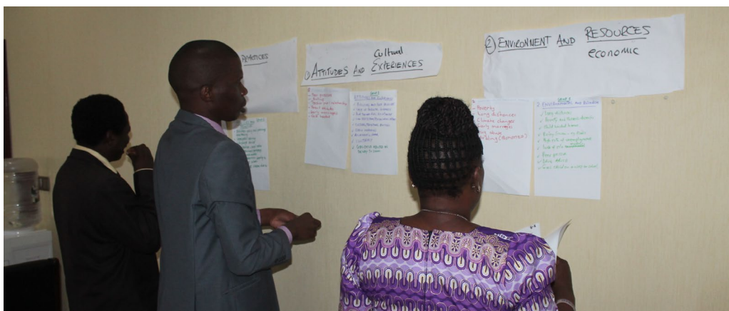
Teachers in Zambia reviewing the categories of barriers

The trainer asks the groups to refer to the barriers that were listed during Activity 3.1a , and discuss for five (5) minutes which barriers fit within which categories. The trainer should then facilitate a plenary discussion, ensuring that each category of barriers is covered during the discussion, drawing on examples from real-life practice. These can be based on the teachers' experiences, the trainer's experiences and the ideas in Resource 3.2 .