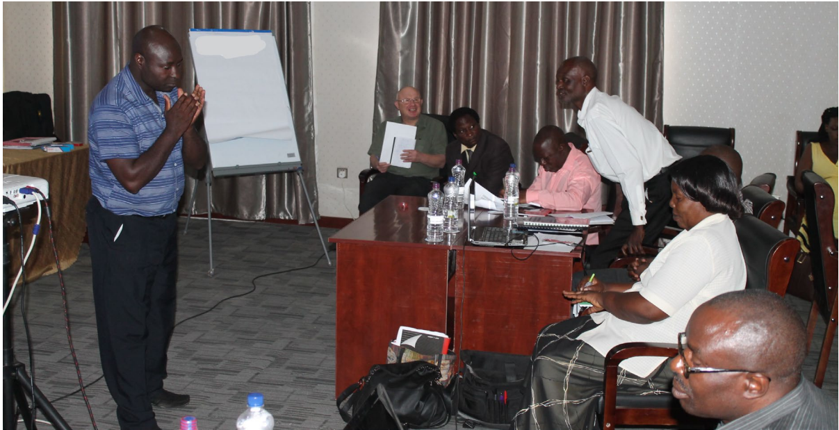
Teachers in Zambia playing the 'but why' game

[Image description: A man stands on the left of the photo, facing a group of seated people (7 are visible). He has his hands in front of him, as if clapping them together. The others are looking at him and some are smiling.]