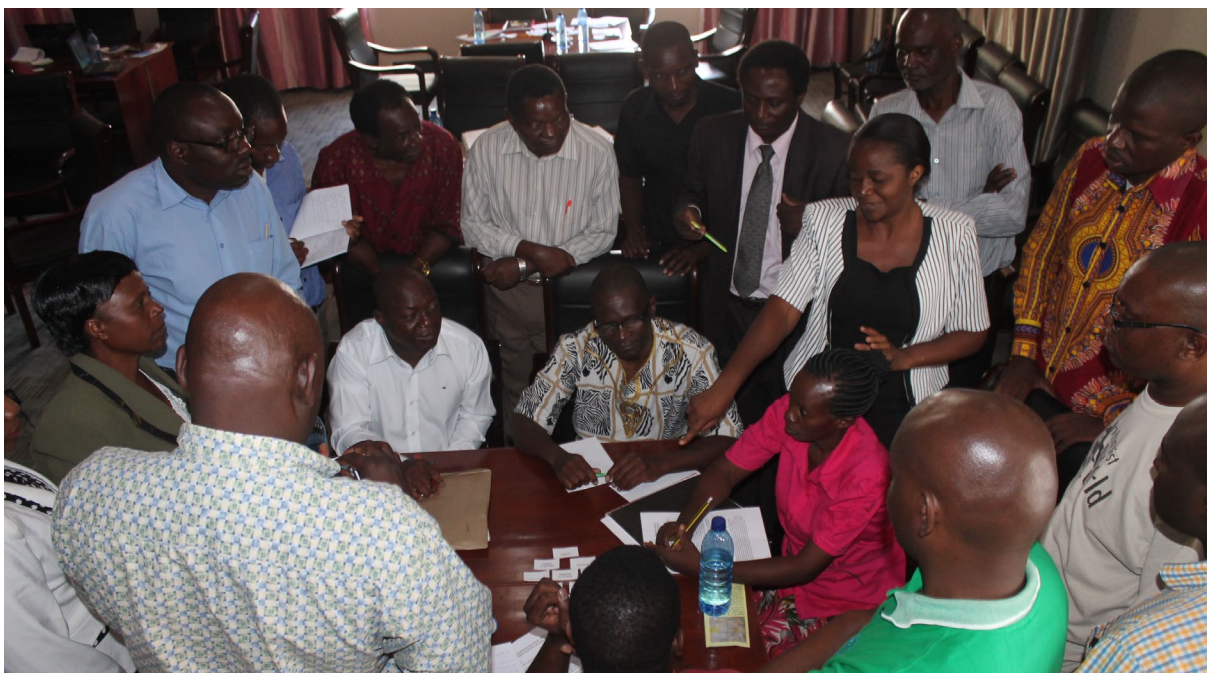
Teachers discuss each group's diamond 9 arrangement

When the groups have finished ordering their cards, all teachers move from table to table and each small group discusses how and why they ordered their cards as they did. This should take 20-25 minutes.