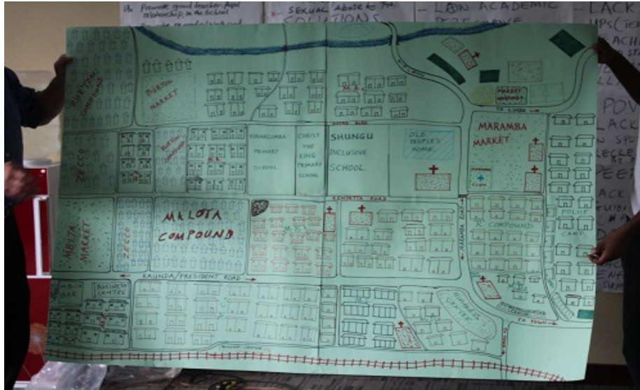
An example of a map created in Livingstone, Zambia

[Image description: The map shows the layout of straight and curved streets. There are lots of small squares illustrating where houses, shops and schools can be found.]