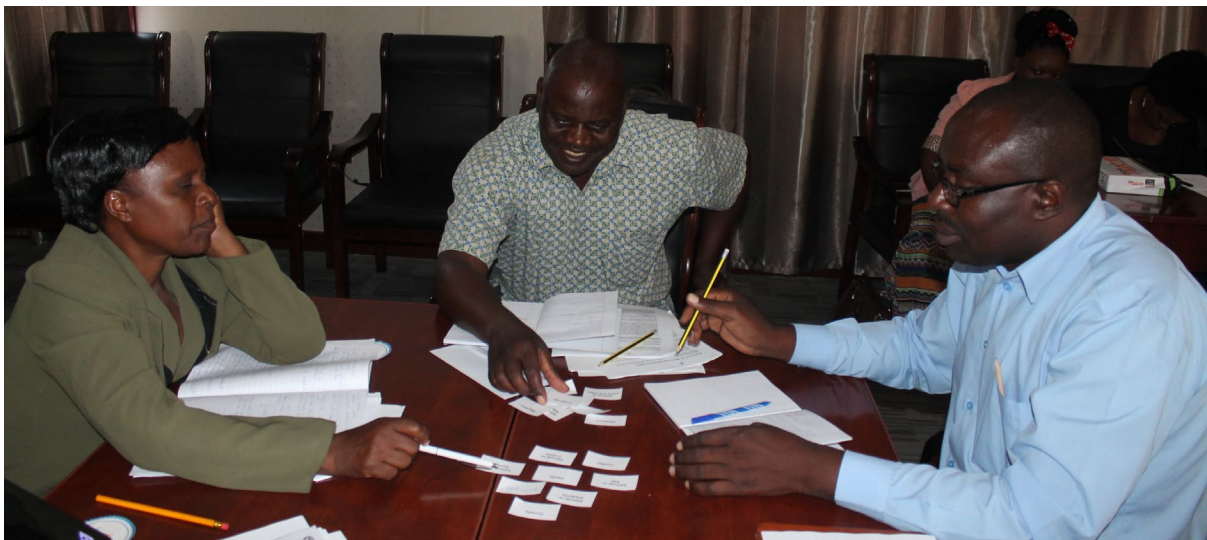
Teachers in Zambia discussing their diamond 9 cards

[Image description: A woman and two men are sitting around a table. On the table are some small pieces of paper with writing on, which have been arranged into a diamond pattern. The woman is pointing at a card and the participants appear to be discussing.]